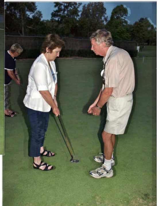
Strathfield Golf Club 13.3.13